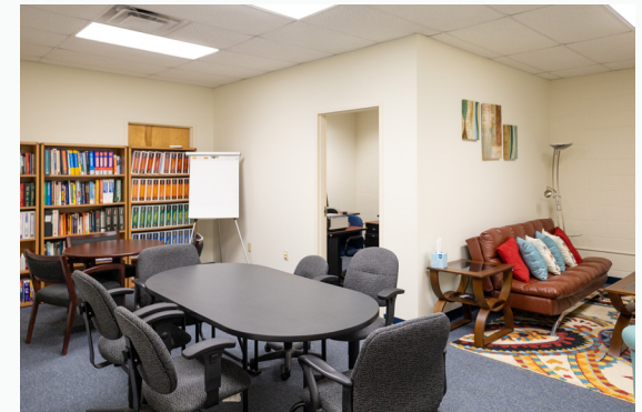
ENTREPRENEUR & RESOURCE CENTER