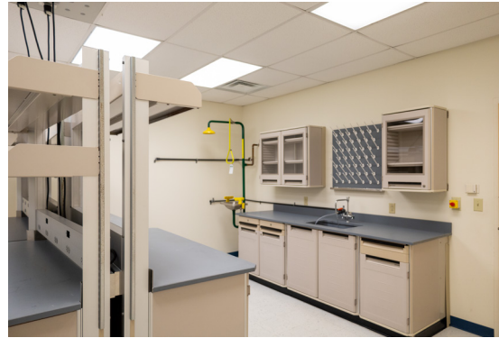
WET LABS $18 PER SQ. FT.