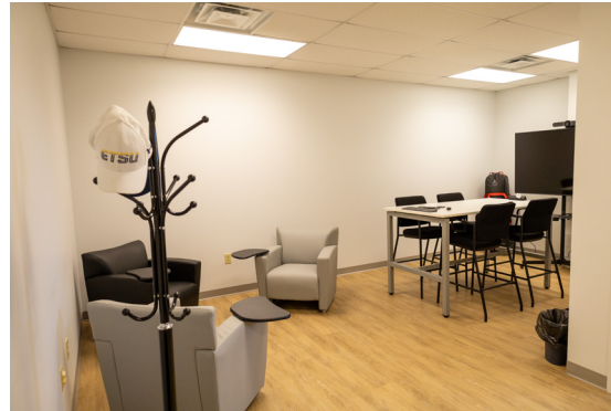
OFFICE SPACE $10 PER SQ. FT.